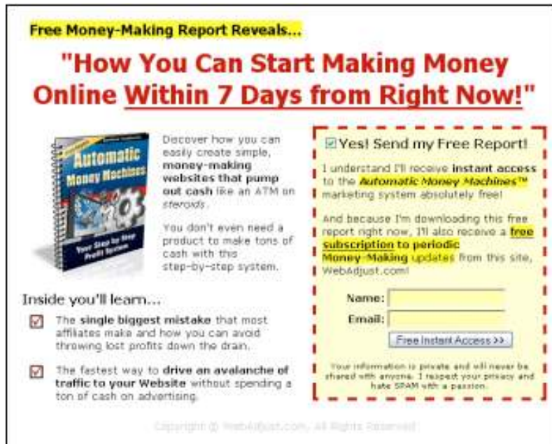
Image: Example Squeeze Page